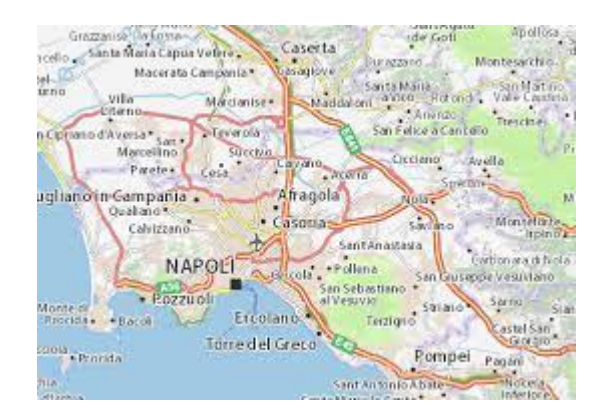
HOW TO GET NAPLES AND CASALNUOVO DI NAPOLI

In the oldest area is the church of Santa Maria dell'Arcora, known as 'della Putechella': it looks like a small temple in classical style. In Licignano is the 18th-19th century Palazzo Lancillotti. The municipal capital stands on the ruins of Archora, one of the villages that had given rise to the neighbouring town of Afragola. The climate is typically Mediterranean, characterised by very hot summers and not very cold winters.